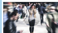
Anxiety Does Not Need To Be A Lifelong Battle.