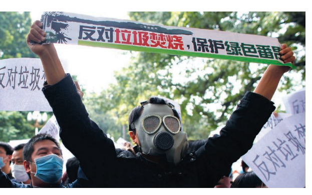
Protests. Chinese citizens protest against the planned Guangzhou trash incinerator in 2009. Their banners read, "Oppose the trash incinerator."

The landmark of environmental civilian activism occurred in Xiamen City in 2007. The local government supported construction of a $1.4-billion paraxylene plant near the center of the city. Information about the environmental impact of this project was not made available to the local residents. The people of Xiamen City were outraged when-through cell phone messages and the Internet-they learned of the plant's environmental risks. A phone text message was circulated among Xiamen citizens in late May calling for a "collective walk" (demonstration). On 1 June 2007, more than 1000 citizens gathered in front of the municipal building