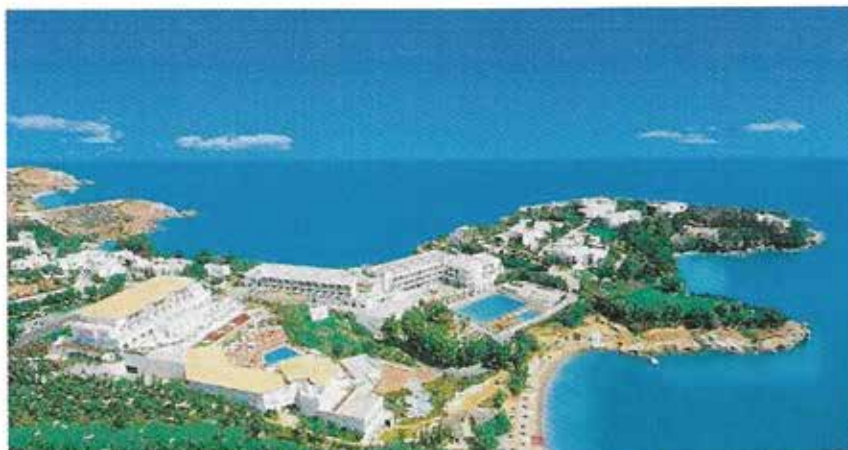
Capsis Beach Hotel & Sofitel Capsis Palace Hotel

84 Confirmed speakers by August 31, 2006