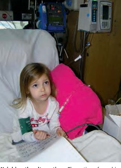
Weighing the alternatives. The option of new biologic therapies, which this little girl is receiving for her juvenile arthritis, make trial recruitment difficult.

Studying these cells, gathered over time, Muraro discerned a large number of T cells